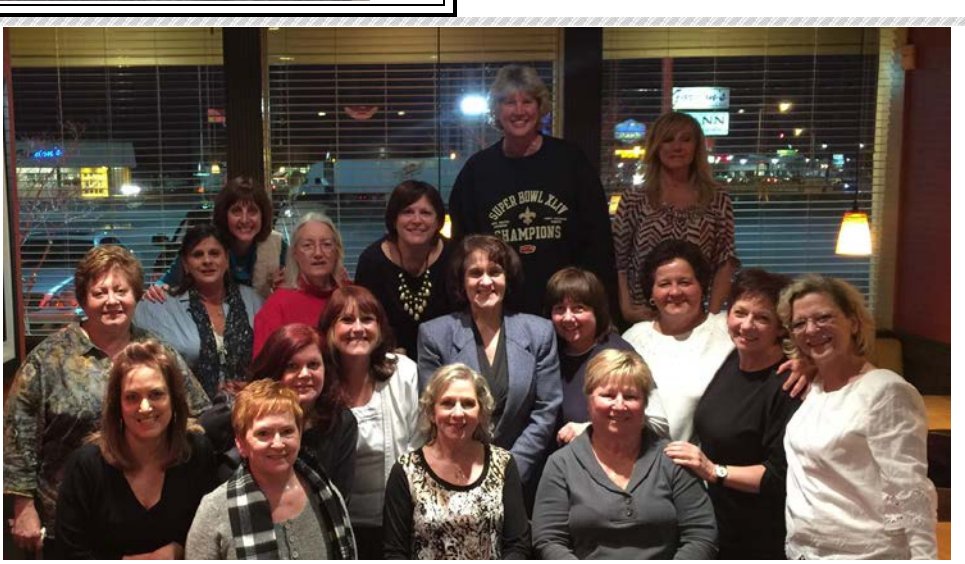
A MEETING OF SOME OF THE MEMBERS OF THE CLASS OF 1974 AT NEW ORLEANS HAMBURGER AND SEAFOOD CO. IN FEBRUARY 2015