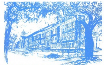
SACRED HEART OF JESUS HIGH